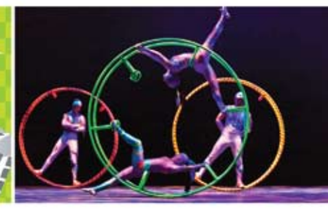
Golden Dragon Acrobats SUN, JAN 28