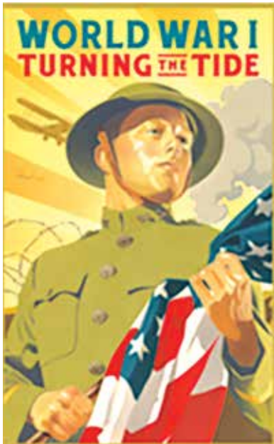
TRIBUTE TO AMERICAN SOLDIERS

With the release of O Beautiful, the Postal Service commemorates the beauty and majesty of the United States through images that correspond with one of the nation's most beloved songs, "America the