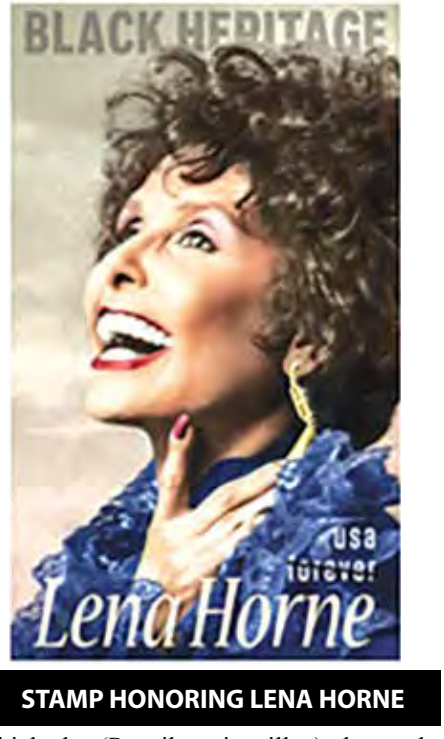
STAMP HONORING LENA HORNE

chickadee ( Parus atricapillus ), the northern cardinal ( Cardinalis cardinalis ), the blue jay ( Cyanocitta cristata ), and the red-bellied woodpecker ( Melanerpes carolinus ).