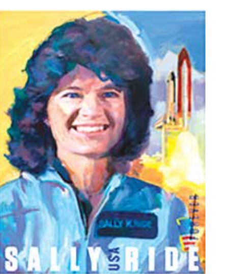
STAMP HONORING SALLY RIDE

John Lennon (Music Icons series) The newest stamp in the Music Icons series honors singer and songwriter John