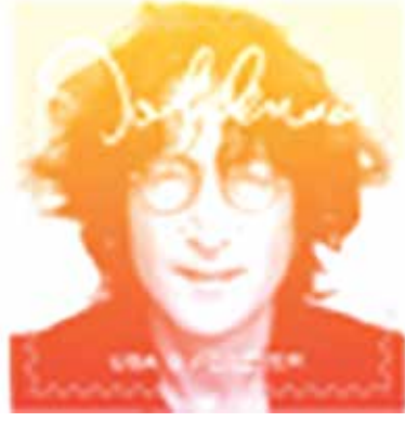
STAMP HONORING JOHN LENNON

Detailed information and issuance dates on these stamps and others will be revealed later. All stamp designs are preliminary and are subject to