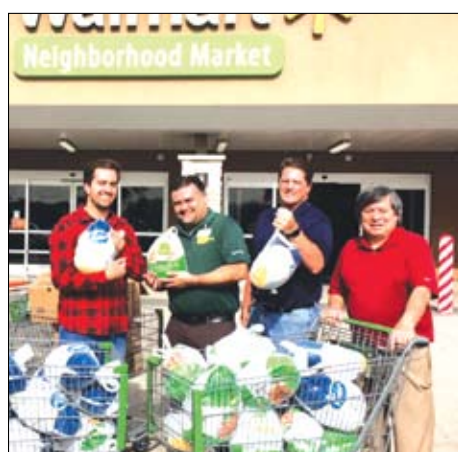
La Mirada Rotary helps needy families. Page 5.