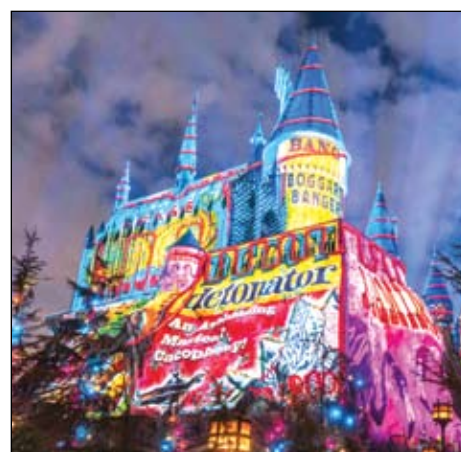
Xmas at the "Wizarding World of Harry Potter." Page 9.