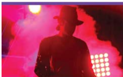
Moonwalker: The Reflection of Michael SAT, NOV 25

YOUR FAVORITE ENTERTAINERS. YOUR FAVORITE THEATER