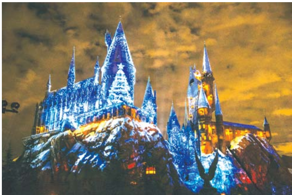
The all-new "Christmas in The Wizarding World of Harry Potter" experience will take place daily from November 24, 2017 through January 7, 2018 transforming Hogwarts™ castle using a breathtaking animated light projection show that is choreographed to a musical arrangement from the Harry Potter movies.