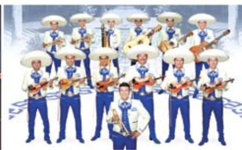
Merry-Achi Christmas SAT, DEC 2