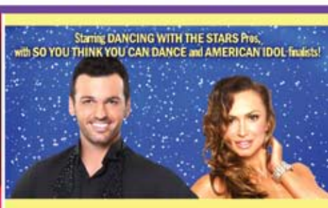
Dance to the Holidays SUN, NOV 26