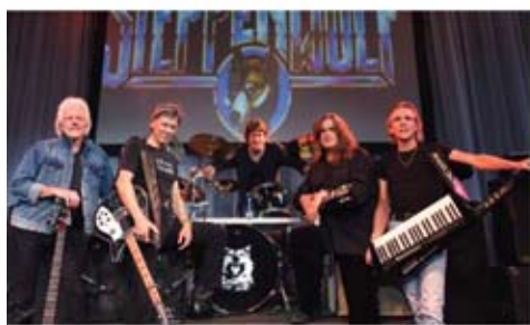
John Kay & Steppenwolf FRI, DEC 1