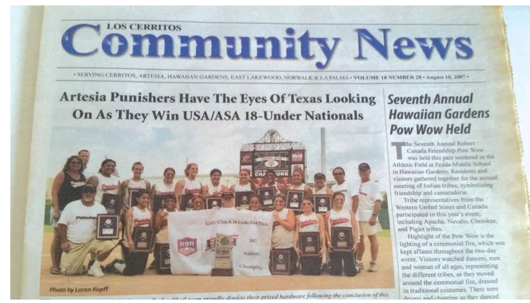
2007 CHAMPS – August 2007 HMG-CN front page article about the Artesia Punishers 18-under National Title team.

"That was a game where, and if you remember back then, the girls could come back from college and play," Me-