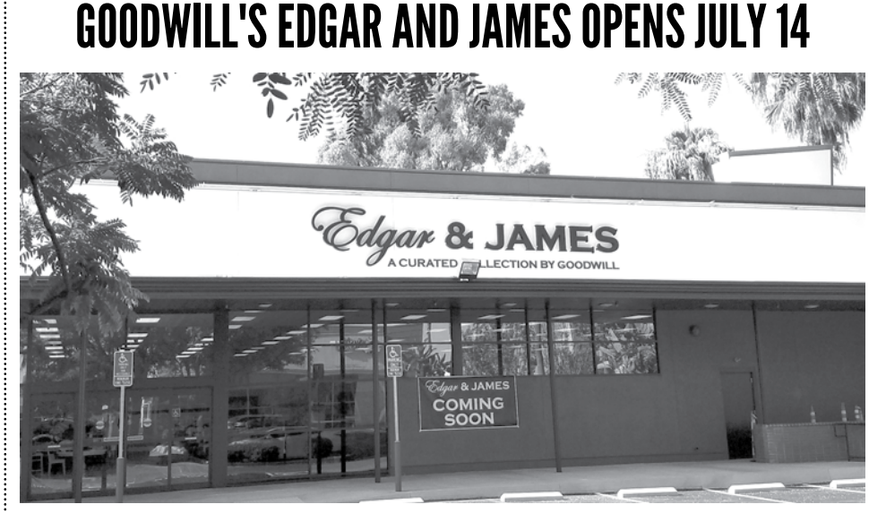
Goodwill's new concept store – Edgar & James, A Curated Collection By Goodwill – is opening its doors in Bixby Knolls July 14.

Edgar & James, A Curated Collection By Goodwill – is opening in Bixby Knolls next week. The new store will be revealed at a grand opening ceremony taking place at 8:30 am on Friday, July 14 at the store's entrance located at 4121 Atlantic Boulevard in Long Beach.