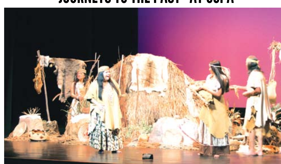
The "Journeys to the Past" performance was targeted toward third through sixth graders. It was attended by the ABC Unified School District, Bellflower Unified School District, Compton Unified School District, Long Beach Unified School District, a home school and a private school.