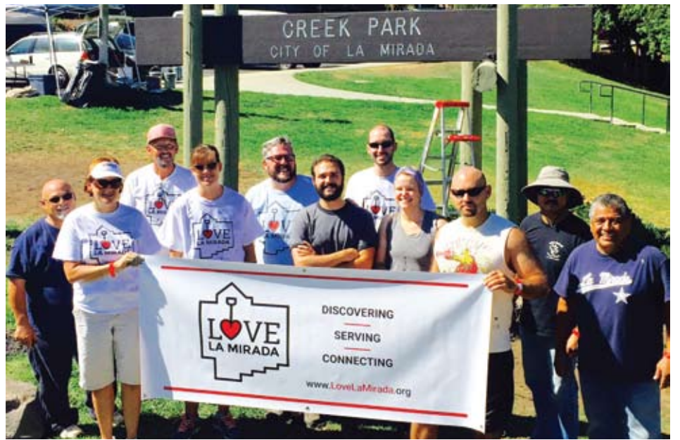
Some of the many volunteers who helped clean up Creek Park. This month's event will take place on Saturday, October 29. Volunteers are asked to meet at the Resource Center at 8:30 a.m.