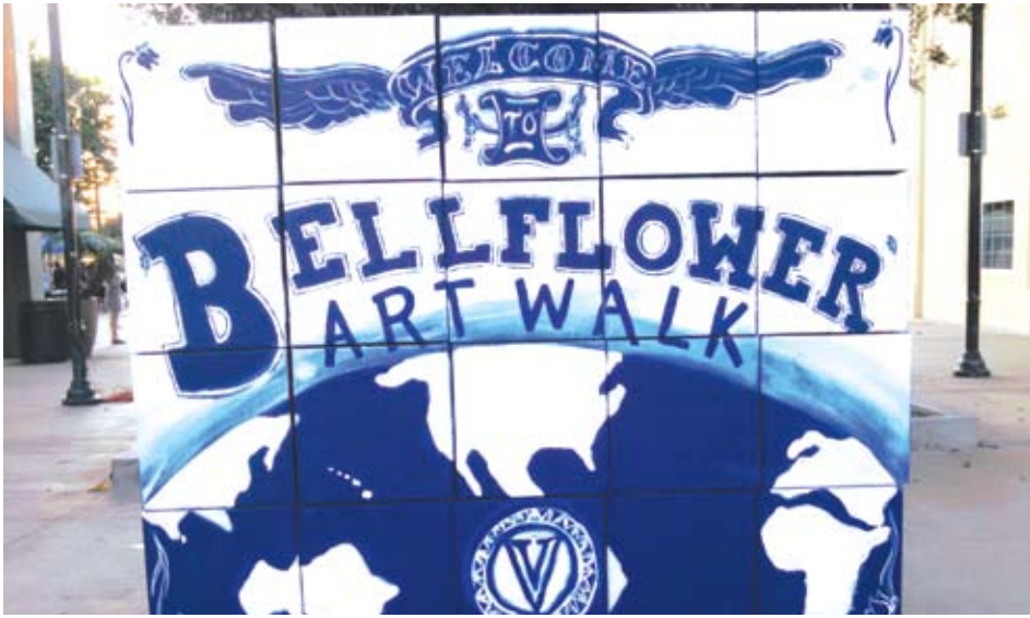
The City of Bellflower held their first of three downtown art walks. The Bellflower Art Walk will have two more events on November 19th and December 10th.