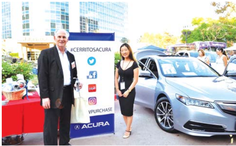
TOP: Attendees enjoy the food and business networking at the Taste of the Region.