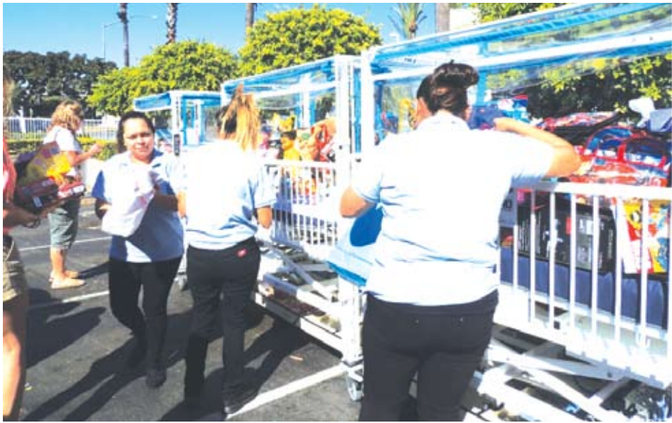
Timmons employees work at the toy drive. Partnering with the Child Life Program at Miller Children's, Timmons hosts an annual toy drive and car show, playfully named "Toy Jam."

A child's work is play, but when they're faced with a difficult experience like hospitalization, it can be easy to forget the importance of play.