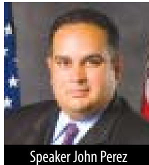
Speaker John Perez