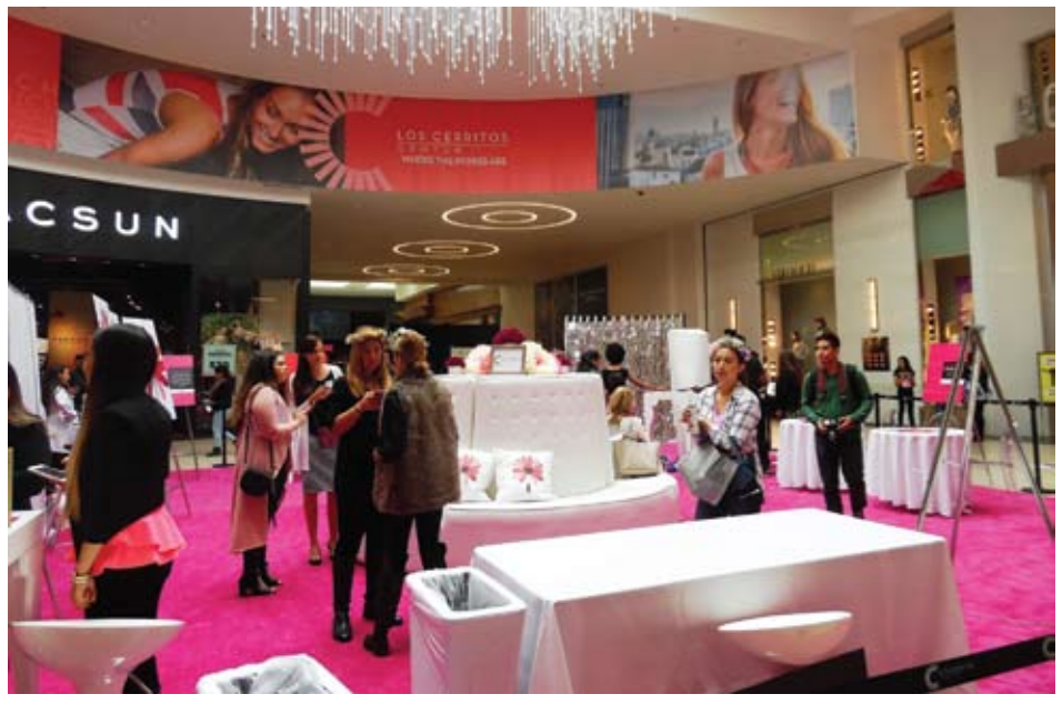
It was a full weekend of glamour and pampering for women at the Mother's Day weekend at Los Cerritos Center.