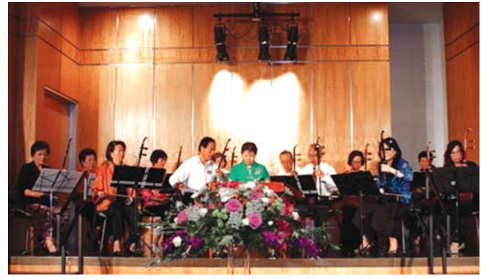
Students from ABC Adult School's Erhu (Chinese Violin) class performed at the Outstanding Student Awards ceremony.

There was standing room only for the families and friends who attended the ABC Adult School Outstanding Student Awards Ceremony Apr. 28 at the Cerritos Library Skyline Room where 27 outstanding students received awards for their talents and scholastic achievements.