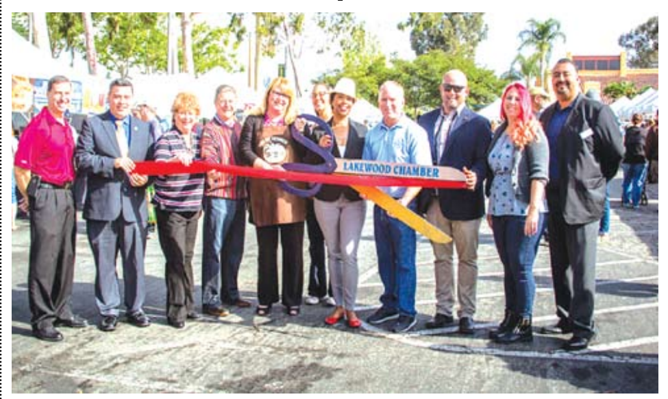
Every Saturday from 8:00 a.m. to noon, the new Lakewood Farmers' Market will be open in the parking area to the west of Target in Lakewood Center. Over 20 farms and 15 vendors will be featured, many of whom are regulars at the Santa Monica Farmers' Market where top-named chefs purchase products for their restaurants. Pictured are Lakewood City Council and staff from the Lakewood Chamber.