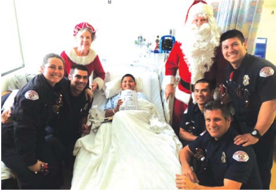
A Miller Children's patients receives a goodie-filled bag from Santa Claus and members of LBFD.