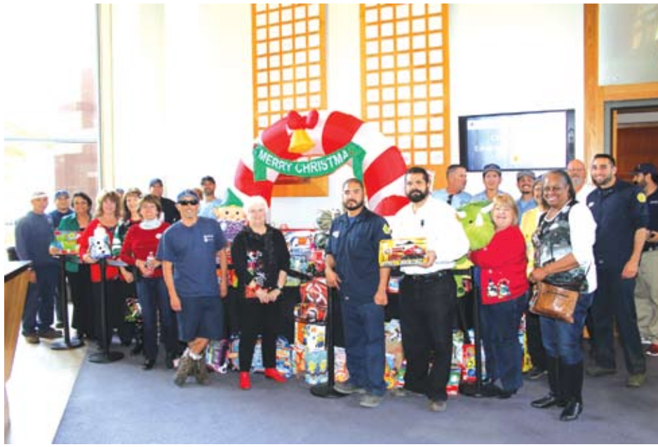
Pictured are the City of Cerritos and Cerritos Sheriff's Station employees. The group donated over 700 gifts and 42 gift cards to families in need. The gifts will be distributed through several local area organizations. "Their actions will help brighten the holidays for many of the less fortunate people in our community this holiday season," said Cerritos Mayor Chen.

"Our City and Sheriff's Station employees were truly generous this season, and my City Council colleagues and I are proud of the generosity displayed," said Cerritos Mayor C. Chen. "Their actions will help brighten the holidays for many of the less fortunate people in our community this holiday season."