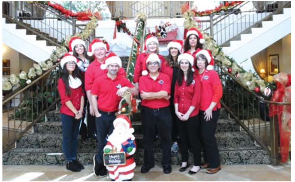
Trinity Reprographics employees decked for the holidays and ready for caroling.