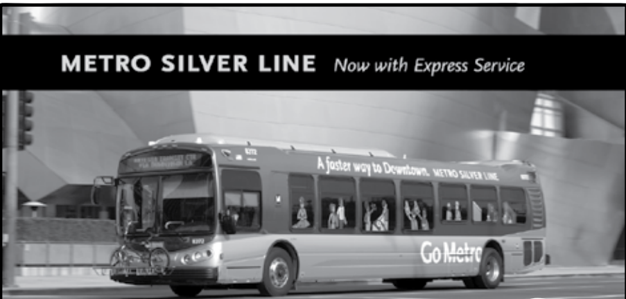
METRO SILVER LINE Now with Express Service