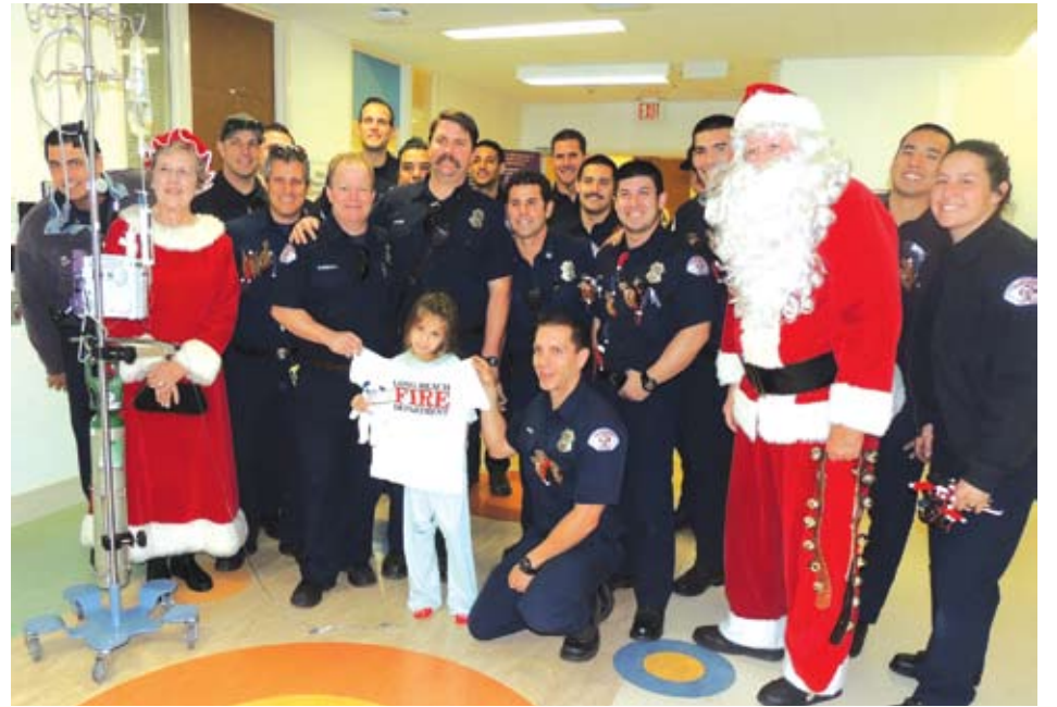
A Miller Children's patient shows off her new LBFD t-shirt with members of the Long Beach Fire Department and Mr. and Mrs. Claus.