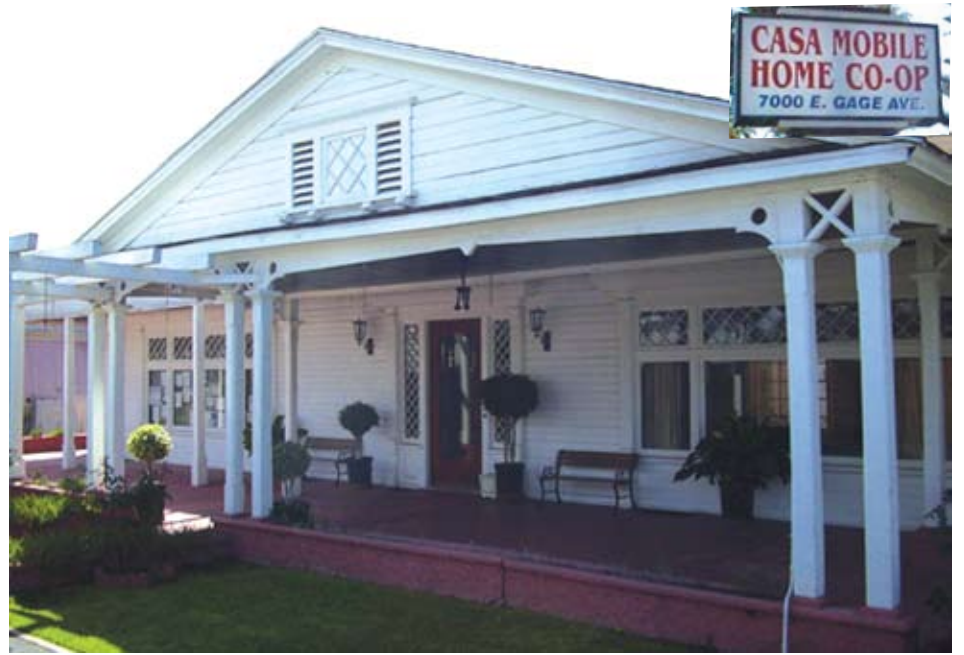
The Gage Mansion is located at 7000 East Gage Ave., Bell Gardens in a trailer park.

Armed with my research and relevant historical information, off we went on our fifteen minute drive to Bell Gardens. As we approached the address of 7000 Gage, we could spot nothing that looked like a house let alone a mansion. I spot-